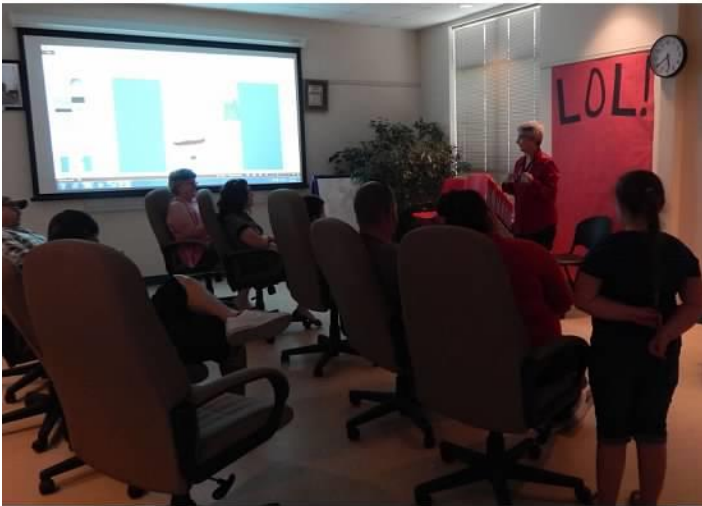
LOL Comedy night at Anahuac