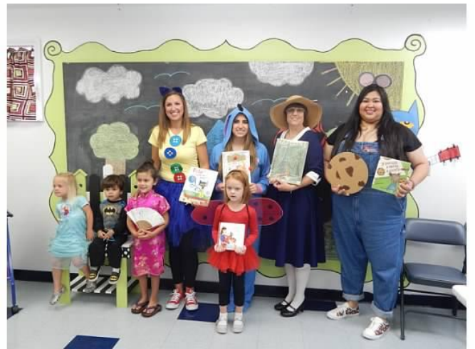
Juanita Hargraves Memorial Branch staff dressed up for Character day!