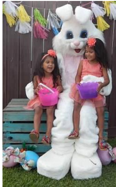
The Easter Bunny visits Anahuac!